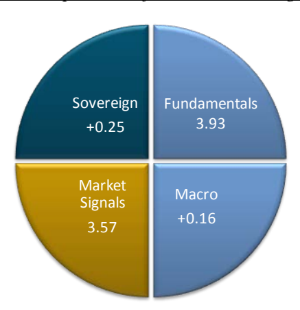
Figure 2: Components of a Credit Scoring Model

Contrary to popular belief, mere risk diversification is inadequate if risk is spread among counterparties with low creditworthiness, as systematic risk remains the same in the portfolio. Thus, one needs to improve the overall credit quality while diversifying, a process that requires a credit measurement system. Although credit ratings traditionally were used for this purpose, their flaws are now more widely recognized. We think that an independent and comprehensive credit scoring system that captures fundamental and market factors as well as analyst judgment may be more appropriate. Figure 2 is an example of our own credit scoring system consisting of four risk categories that measure counterparties on a scale of 1 to 5. The methodology is beyond the scope of this commentary, but we use the scores to illustrate the change in credit quality.