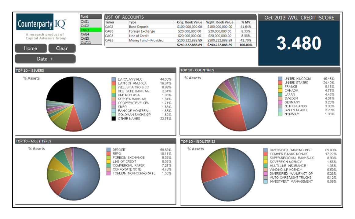
Figure 4: Portfolio Concentration and Credit Score